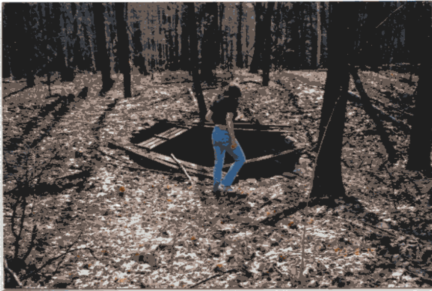
1.01 view of stone-lined "well" (10 feet diameter), 75 feet from corner, 6 feet in from line 255