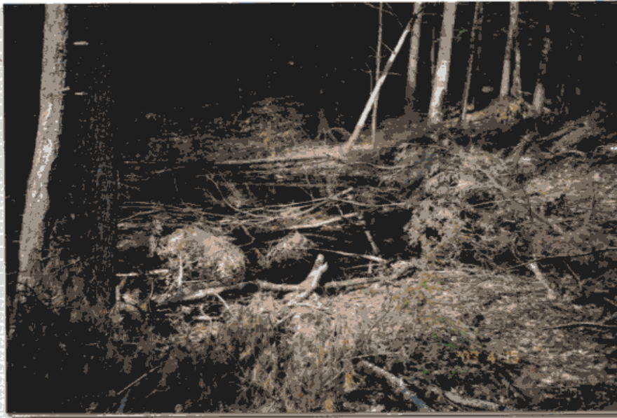
1.11 wet area (probably not vernal pool) partially on 400 1.11 Schuyler side, 250 feet from SW corner