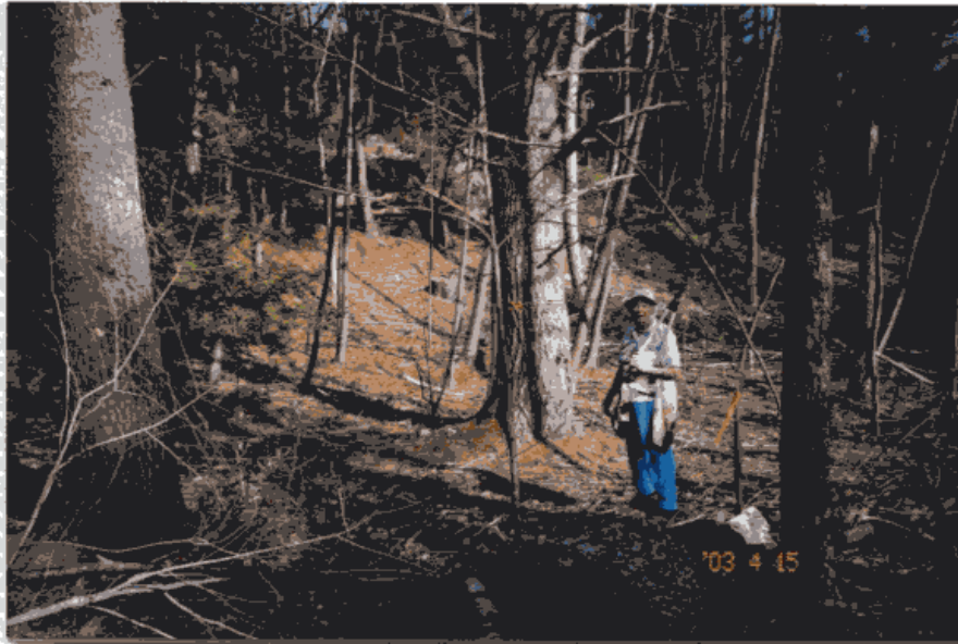
1.09 SW corner forward along line