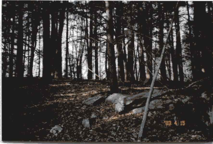
1.13 red oak on property line, 465 from SW corner