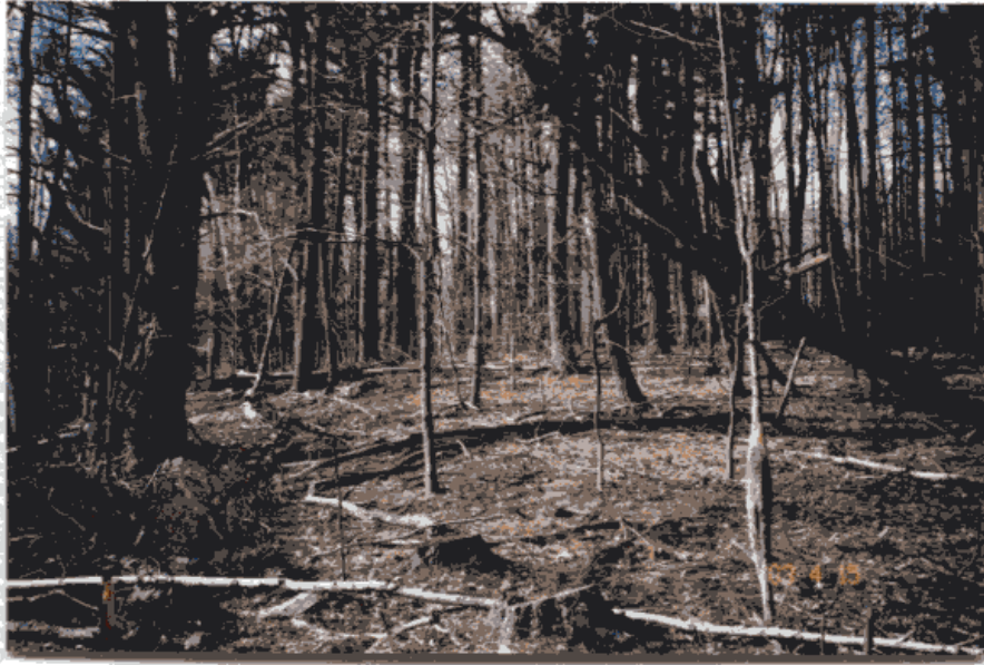
at first of "double corner" (SW corner) back along 1.07 line