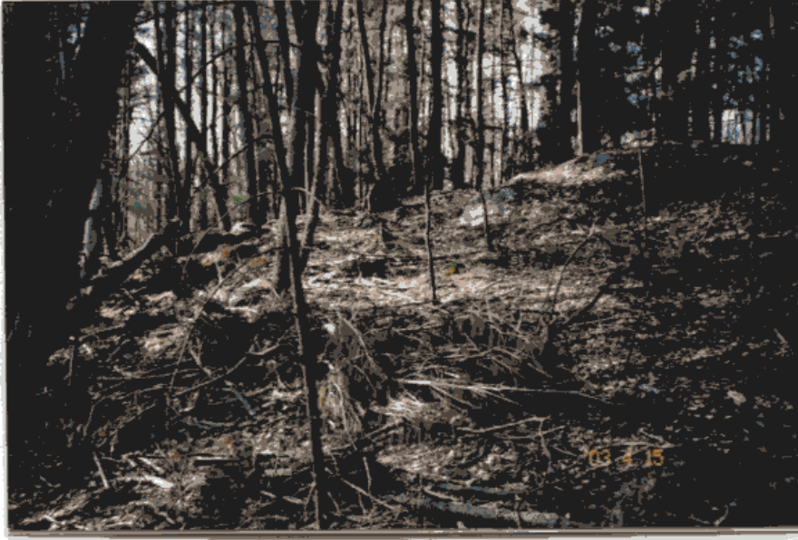
1.10 ledge, looking to other ledge, 70 feet from 350 1.10 second of the double-corner (SW)