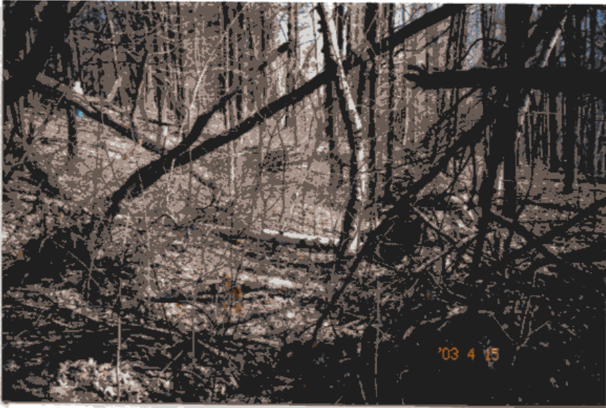
1.02 NW corner, metal pipe at end of short stone wall 157