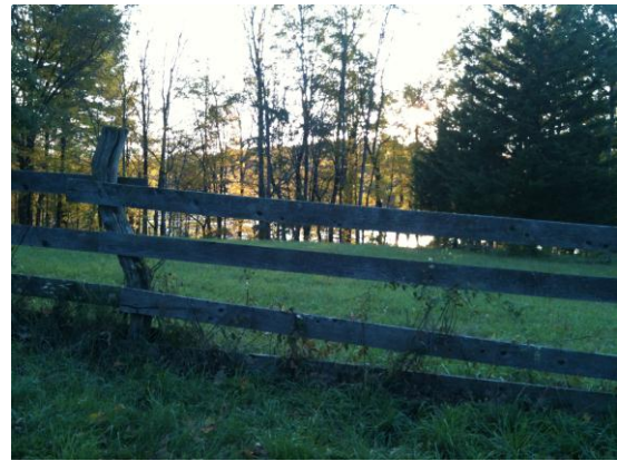
Views from east line (Putney Road) across the CR to Leverett Pond in the late afternoon light.