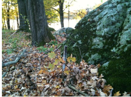
Iron pin next to fast rock (which might have drill hole), along east line.