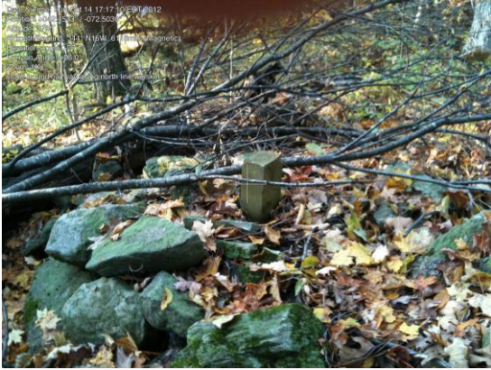
Stone bound midway along north line