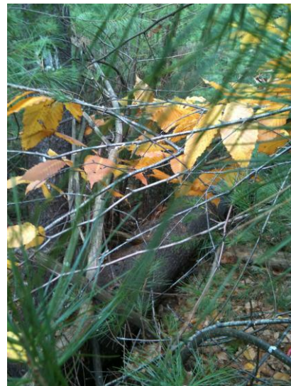
Right: Tree with white corner markings, log, pin (right edge) From same spot also looking north