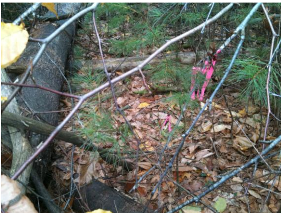
Above: Large pine tree trunk, pin and flag, looking north

IF CR, date third copy sent to owner ? _____