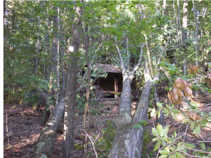
Mosher blowdown 8/20/09 -before