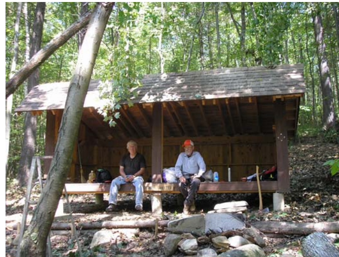
Mosher blowdown 8/20/09 -after