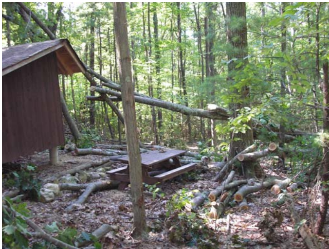
Mosher blowdown 8/20/09 -after