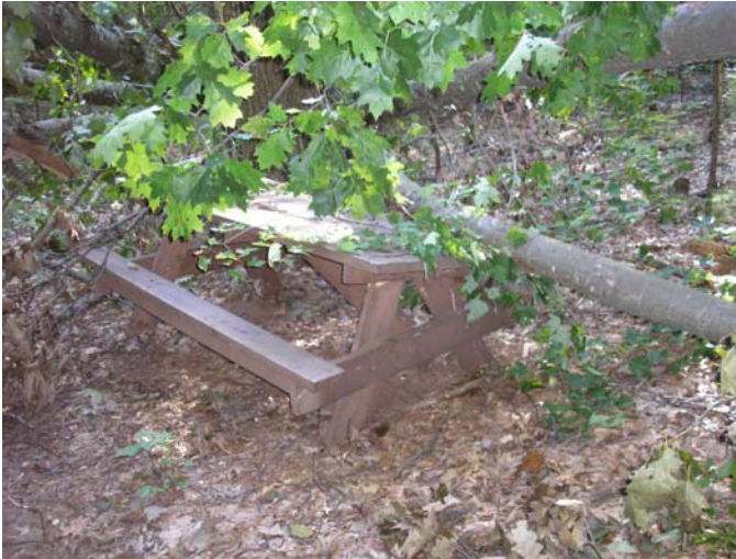
Mosher blowdown 8/20/09 -before