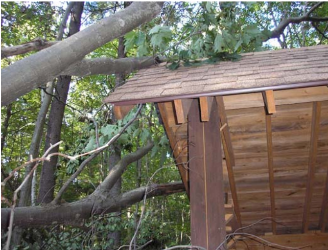
Mosher blowdown 8/20/09 -before