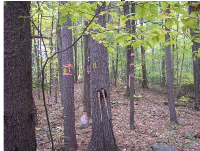
Mosher monitoring 10/6/09