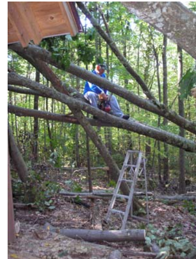
Mosher blowdown 8/20/09 -after