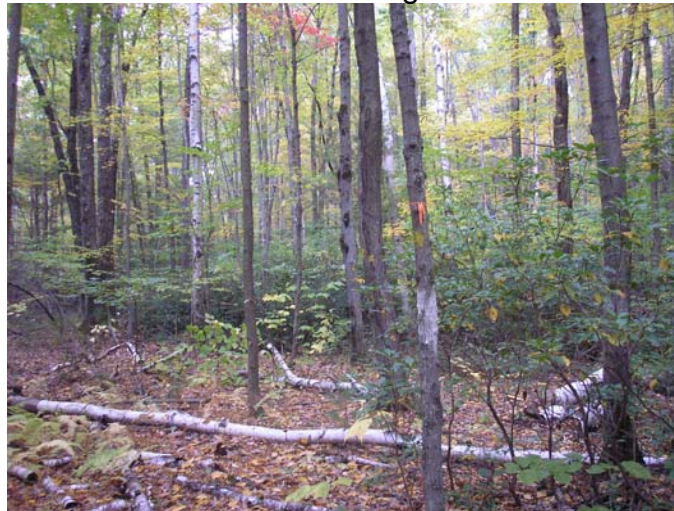
Mosher monitoring 10/6/09