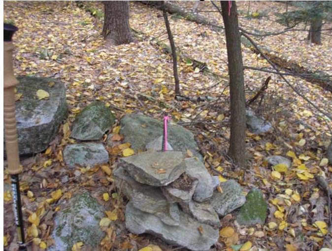
Mosher monitoring 10/6/09