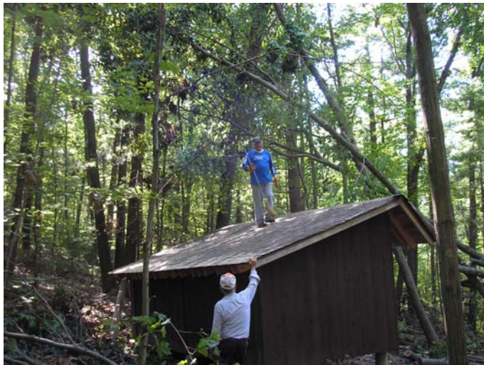
Mosher blowdown 8/20/09 -after