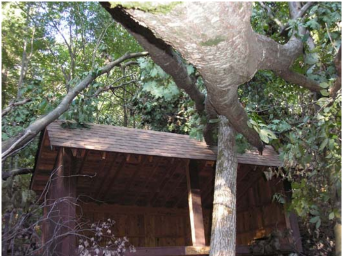
Mosher blowdown 8/20/09 -before