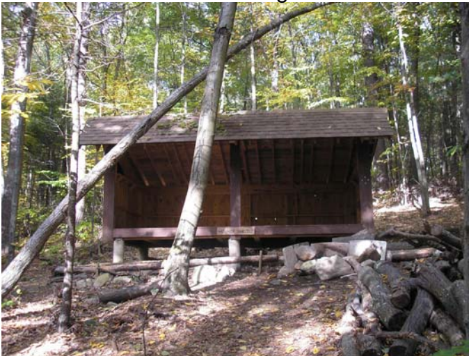
Mosher monitoring 10/6/09