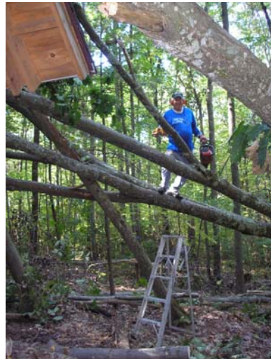
Mosher blowdown 8/20/09 -after