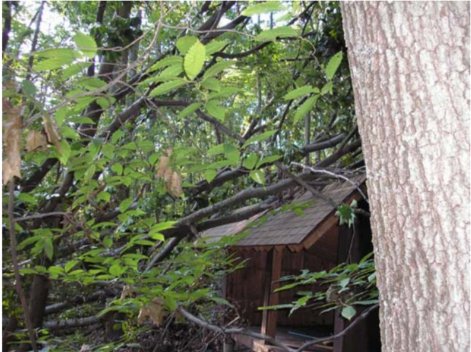
Mosher blowdown 8/20/09 -before