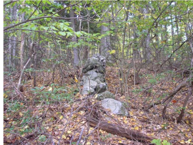
Mosher monitoring 10/6/09