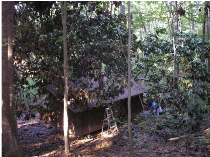
Mosher blowdown 8/20/09 -after