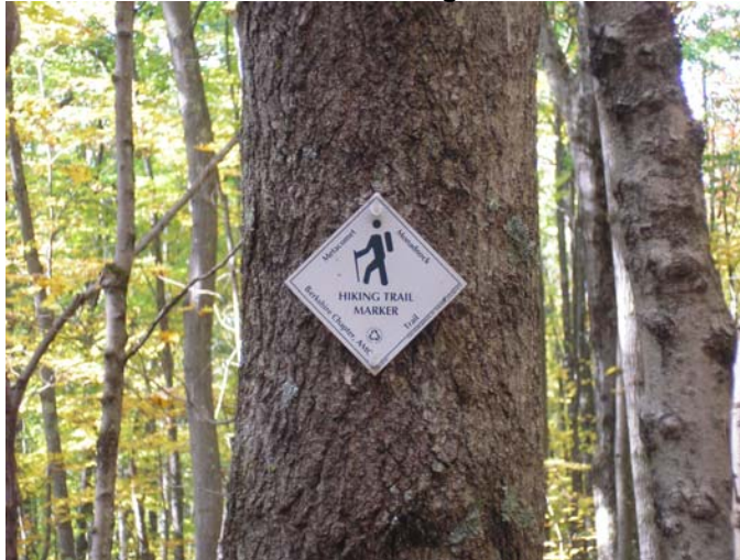
Mosher monitoring 10/6/09