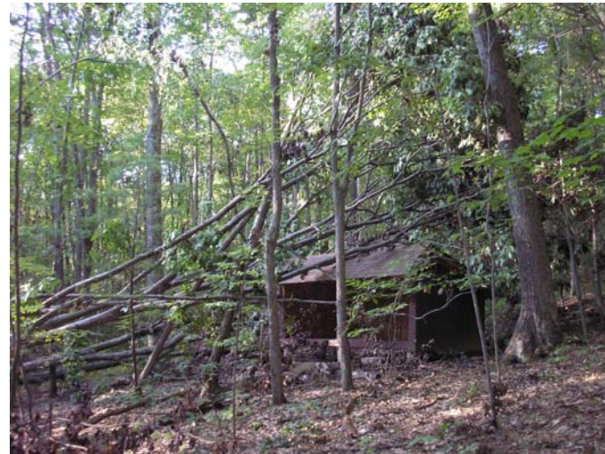
Mosher blowdown 8/20/09 -before