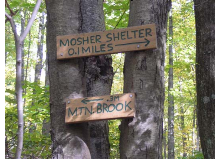
Mosher monitoring 10/6/09