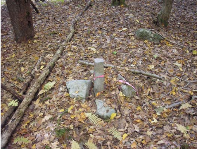
Mosher monitoring 10/6/09