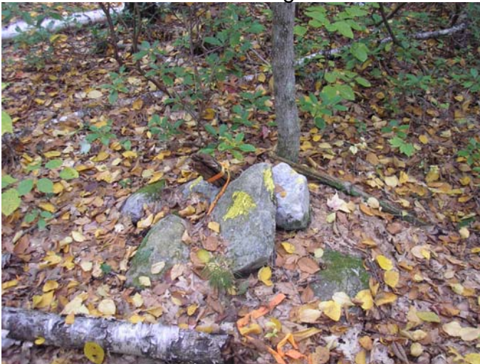
Mosher monitoring 10/6/09