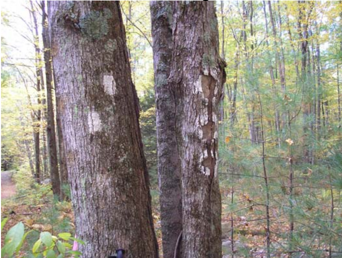
Mosher monitoring 10/6/09