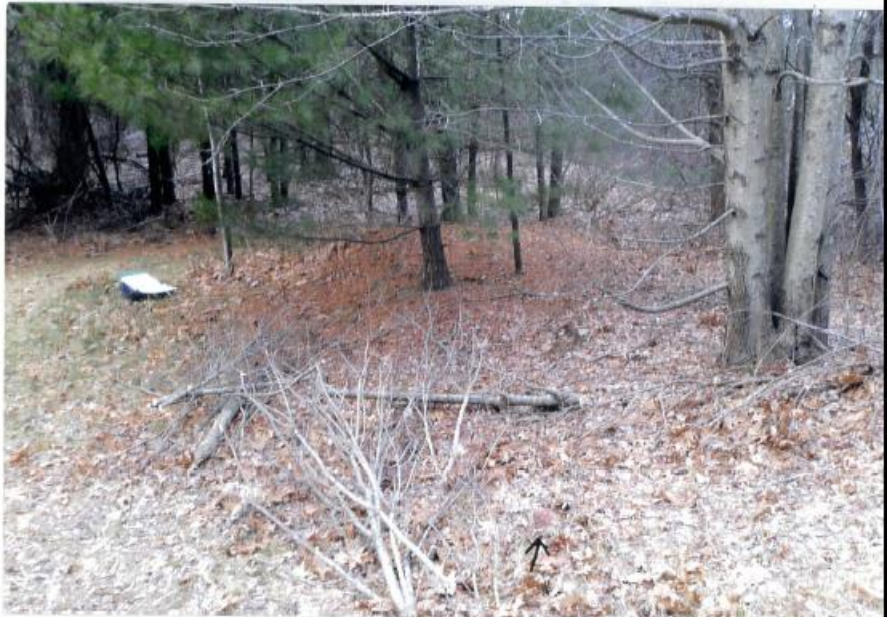
2011. Southwest corner boundary marker.