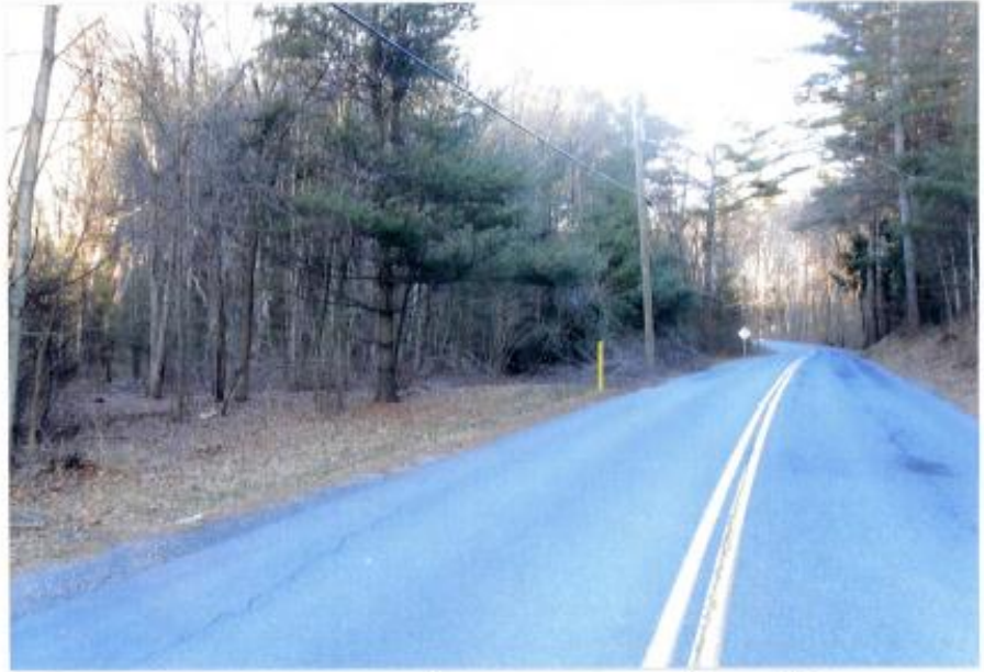
2011. Looking EAST ALONG SOUTHERN BOUNDARY.