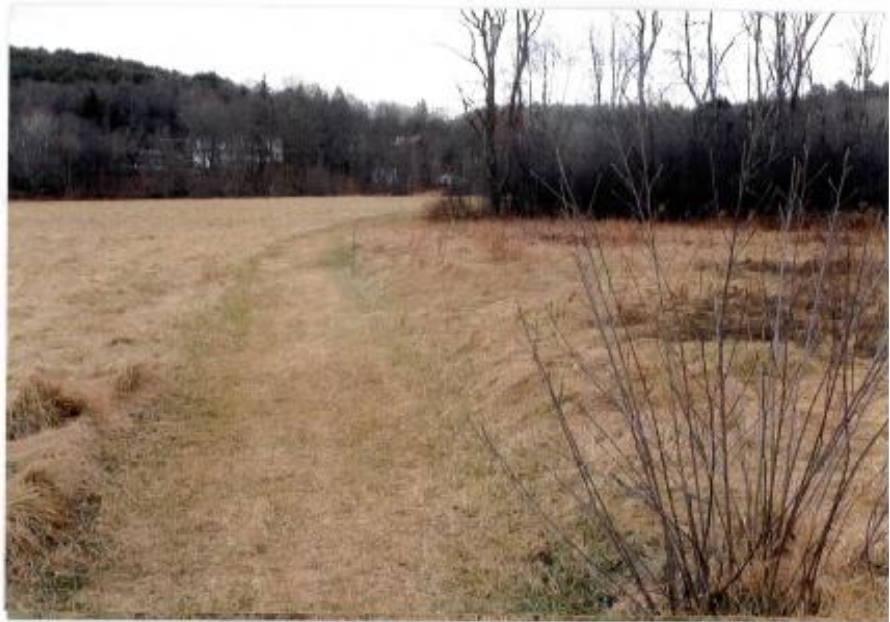
2011. Looking EAST Along Northeast Boundary.