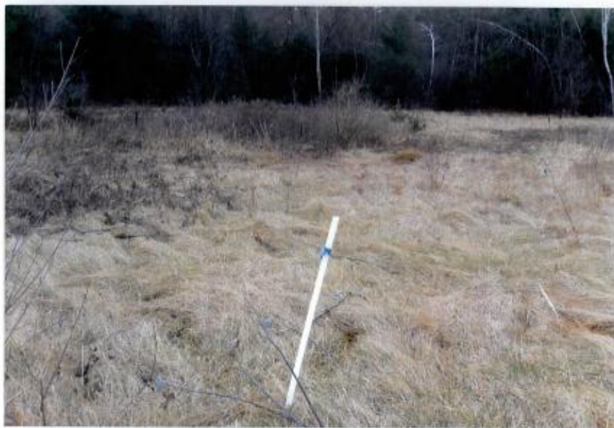
2011 . NORTHWEST CORNER BOUNDARY MARKER.