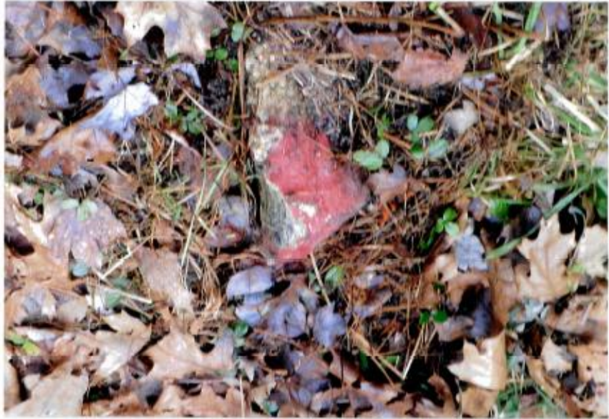
2011. Southeast corner boundary marker.