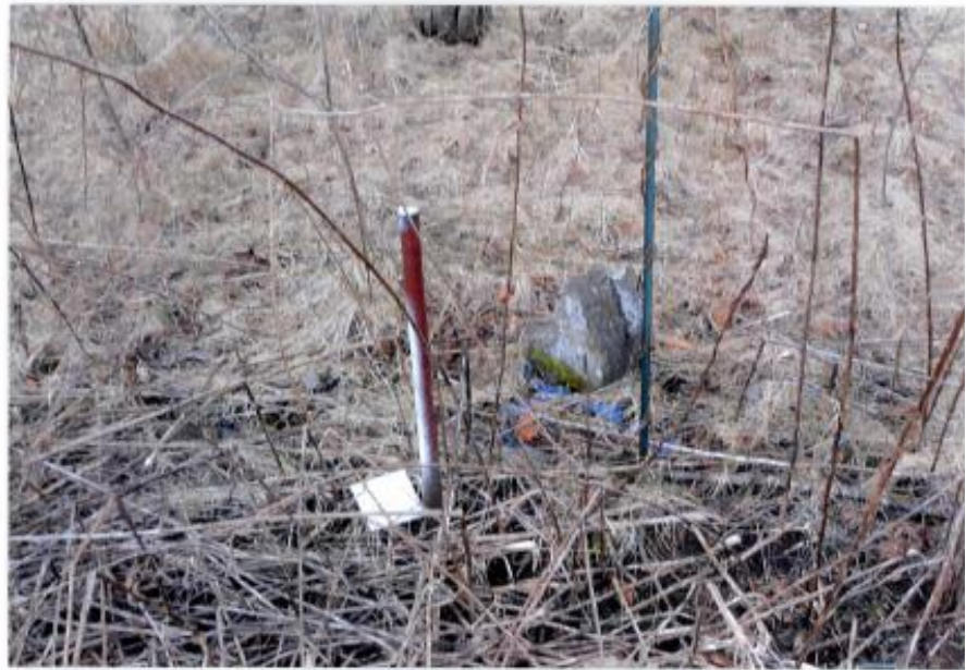
2011. Northeast Corner boundary