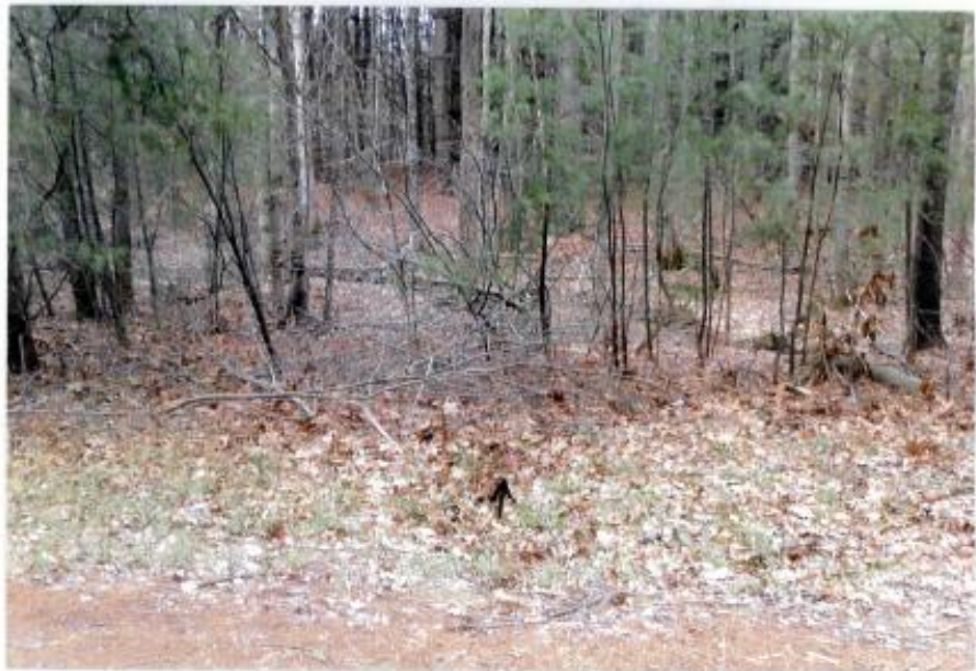
2011. Southeast corner boundary marker.