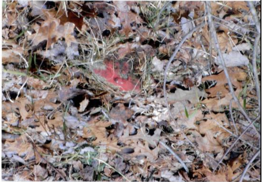
2011. Southwest corner boundary marker.