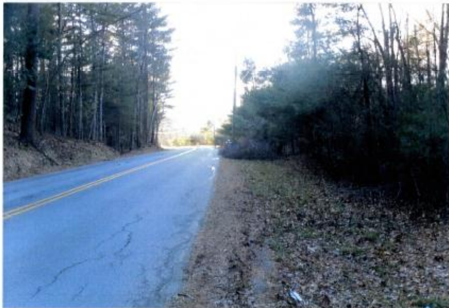
2011 . Looking WEST ALONG SOUTHERN BOUNDARY.