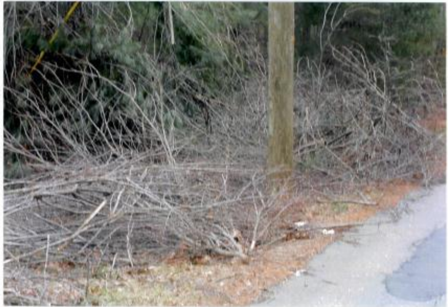
2011. FALLEN BRANCHES ALONG CUSHMAN ROAD.