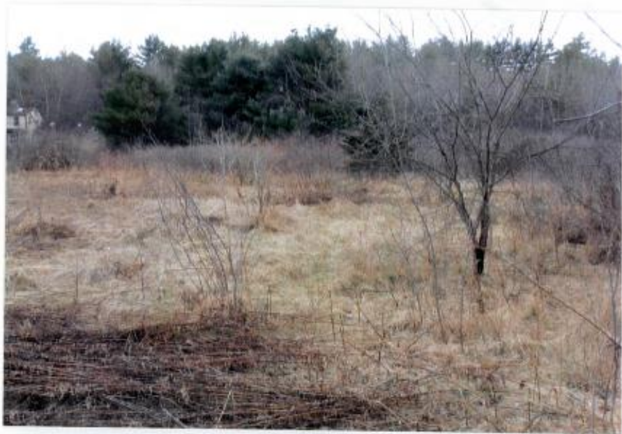
2011 . Looking south along EASTERN boundary.