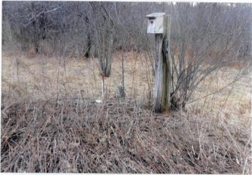
2011 . Northeast corner boundary.