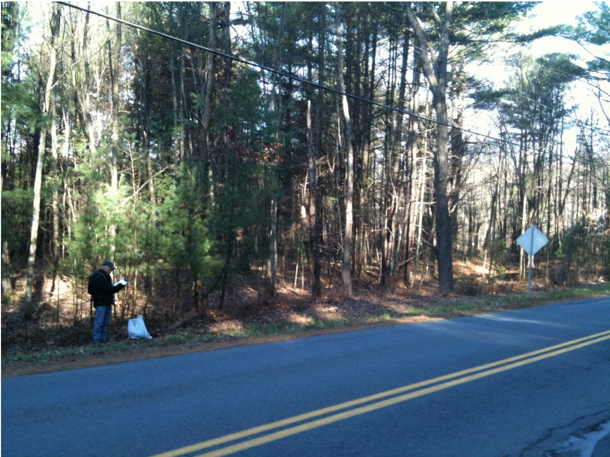
Kuzmeski SE corner stone