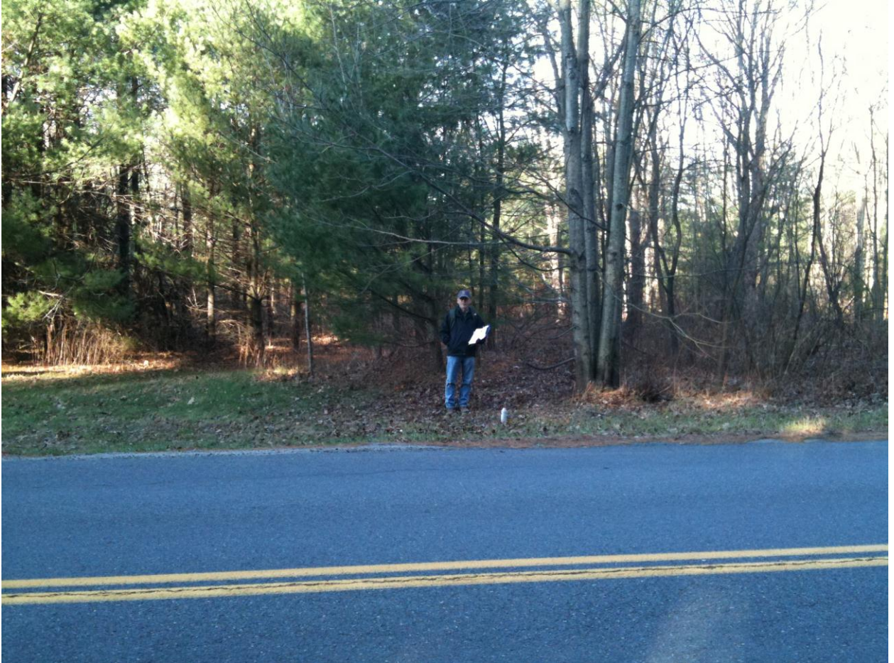
Kuzmeski SW corner stone