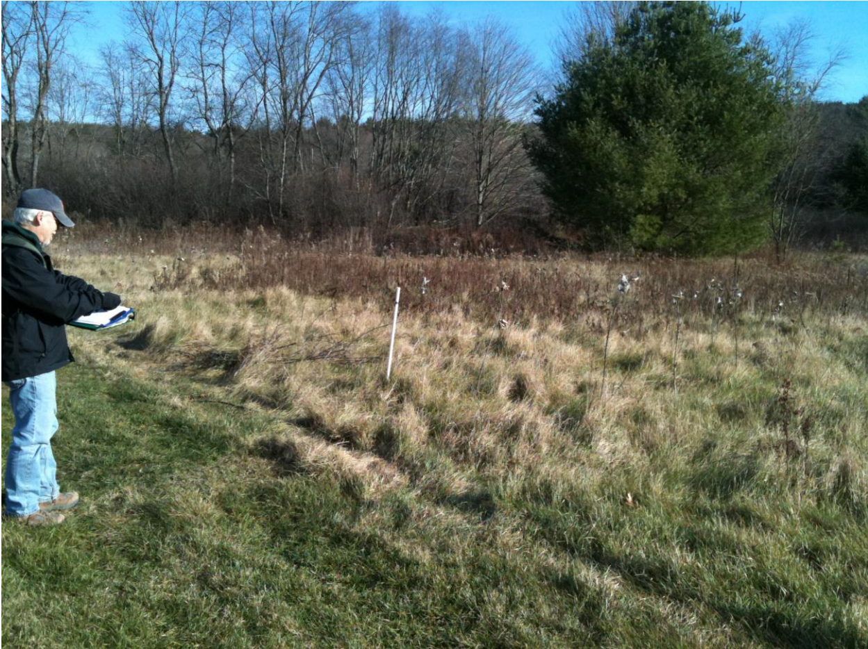
Kuzmeski, NW corner post