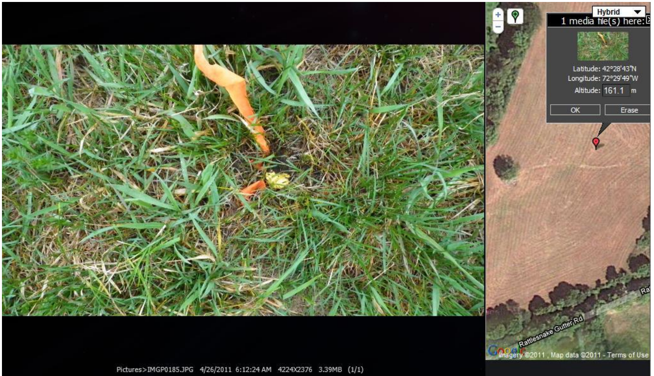
Pin in meadow, point J

Corner post F 11/20/2011 42.45184779 -72.46911725