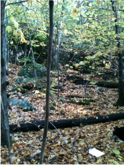
B1. Iron pin on north line (about mid-way)