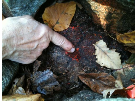
F. Drill hole (along western line)