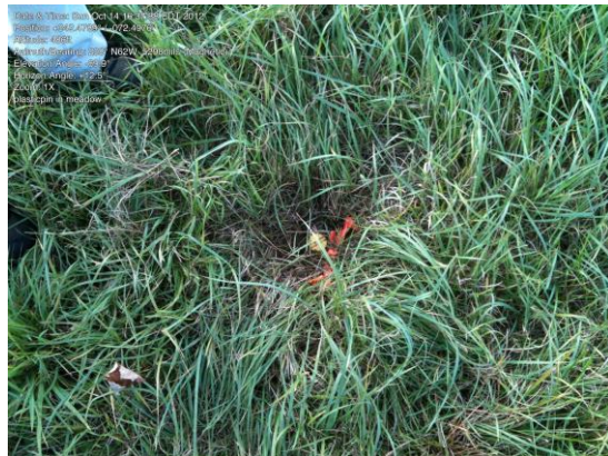
J. Meadow corner (yellow plastic post)