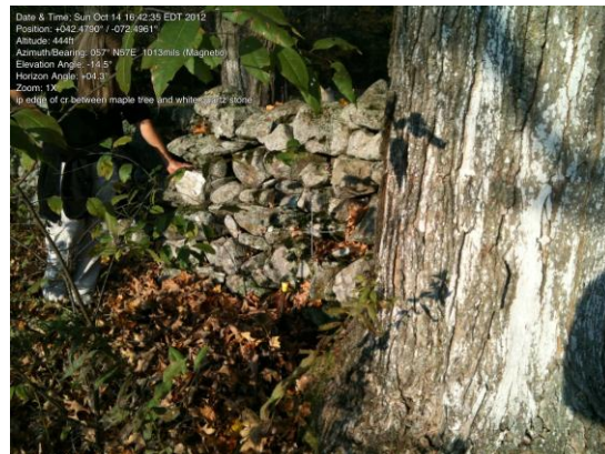
K. IP (yellow top) between white quartz stone and maple tree.