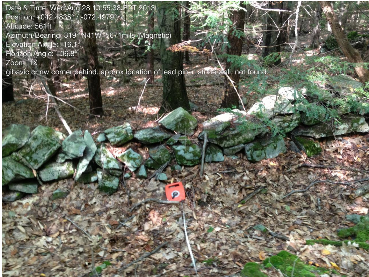
View of the stone wall on the neighboring property (32 feet beyond the NW Corner of the Gibavic Family Conservation Restriction). A lead pin is in one of these stones (mentioned in the survey). Photograph taken at the same place as the previous view up to the drill hole (NW corner) August 28, 2013.