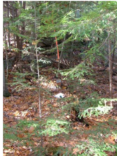
P16. October 21, 2006 015 174° at NE corner post view south along road between Gibavic Family CR (right) and Whitney Road Conservation Area (left) owned by Rattlesnake Gutter Trust.