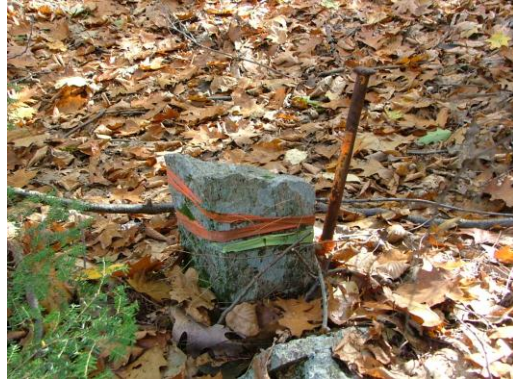
P15. October 21, 2006 014 same stone post