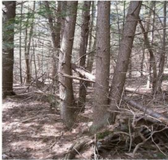
Above: Hemlock uproot found in stand