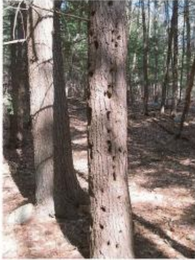
Wildlife Tree Located in Stand 2