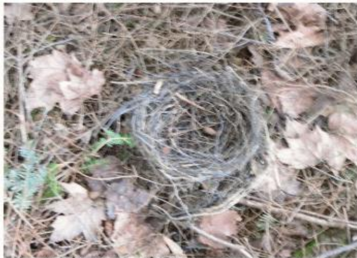
Above: Small bird nest found on the forest floor near the southern boundary of stand 2