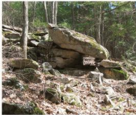
Natural stone structure in Stand 1 near north boundary