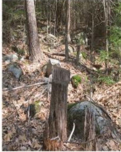
Cut stump in Stand 1