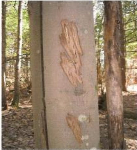
Above: Scratches on a tree, possibly black bear located near the center of the property