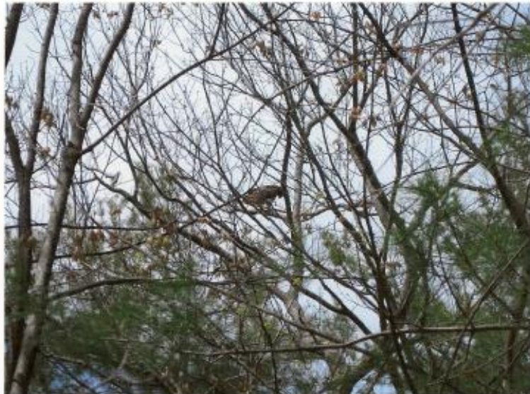
Above: Red Tailed Hawk located in centrally located portion of stand 1 near the northern boundary