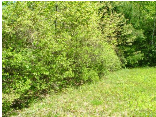
102. along meadow edge

Meadows: On May 18, 2009 heard American Robin, Field Sparrow. Note others walking the land have seen and heard bobolinks.