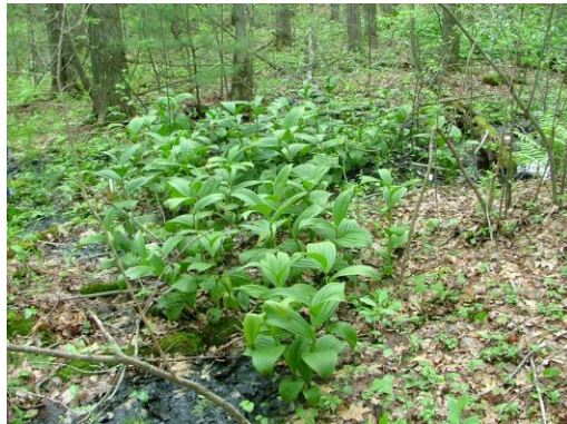
116. Hellebore by seep