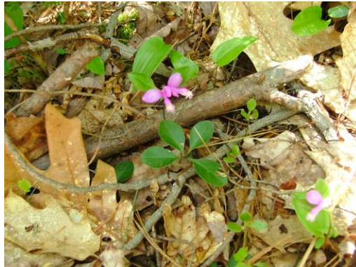
111. Fringed Polygala