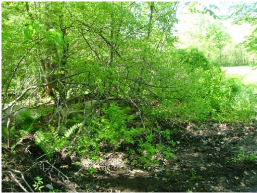
101. along Cave Hill Road

On May 19, 2009: Saw female Eastern Towhee feigning injury to lead us away from nest, flushed Ruffed Grouse and Gray Catbird.