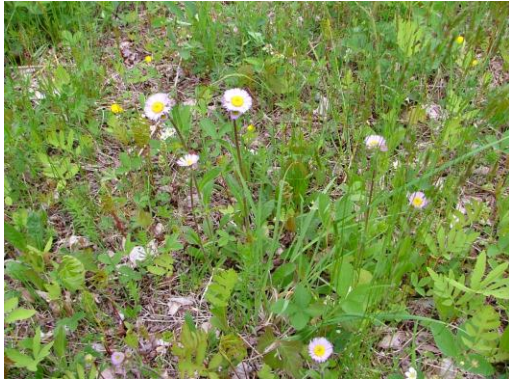
103. Ragged Robin