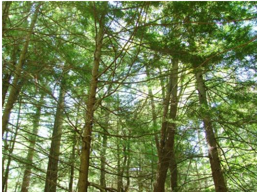
110. Hemlock Grove