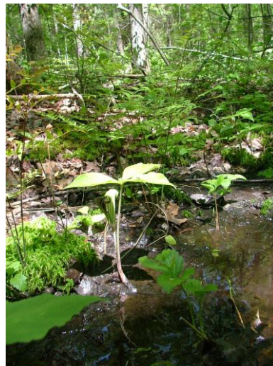
118. Jack-in-the-Pulpit and Royal Fern

Wet forest also includes winterberry and arrowwood.