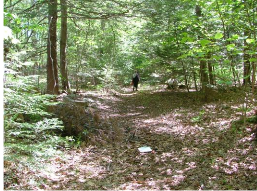
116. At southern boundary looking north 42.49358, -72.48886