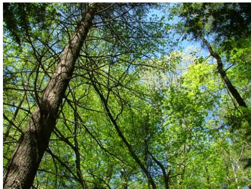
113. Field Pine and Hardwoods