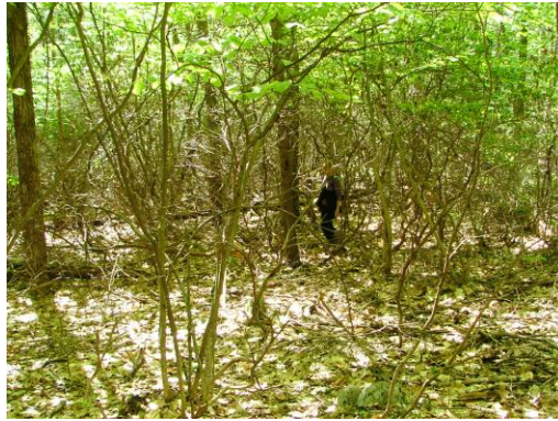
109. Mt Laurel thicket