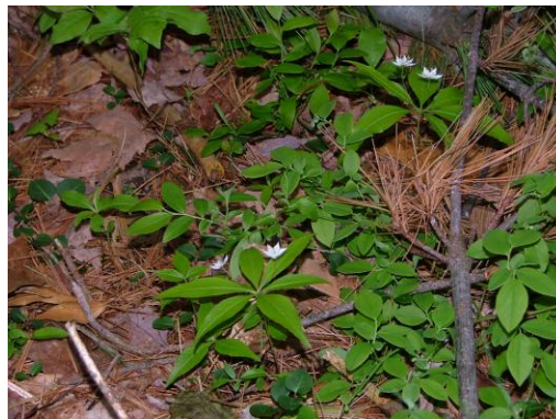
108. Star Flower