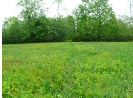
104. Wild Geranium