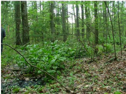
115 Hellebore, meadow beyond