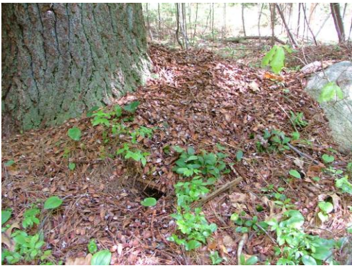
113. Squirrel Picnic Midden