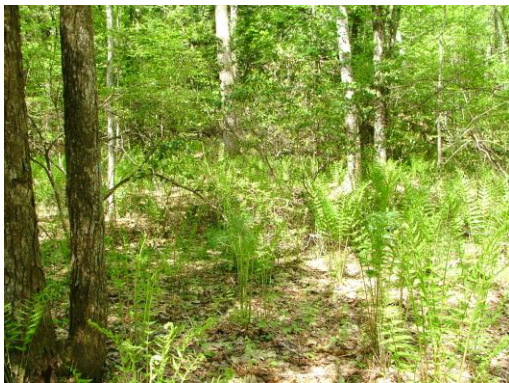
112. Woodland Ferns