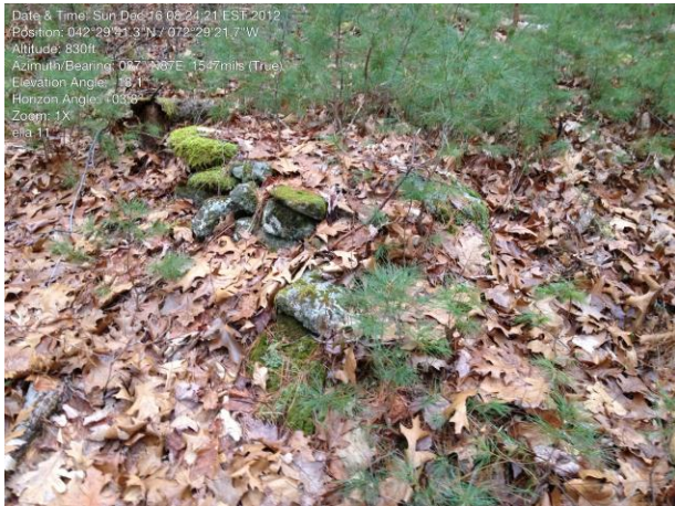
Two of many low lying stone structures, located in the northeast and east side of property, under leaves.