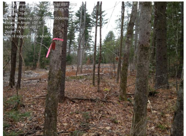
Significant logging to the south.