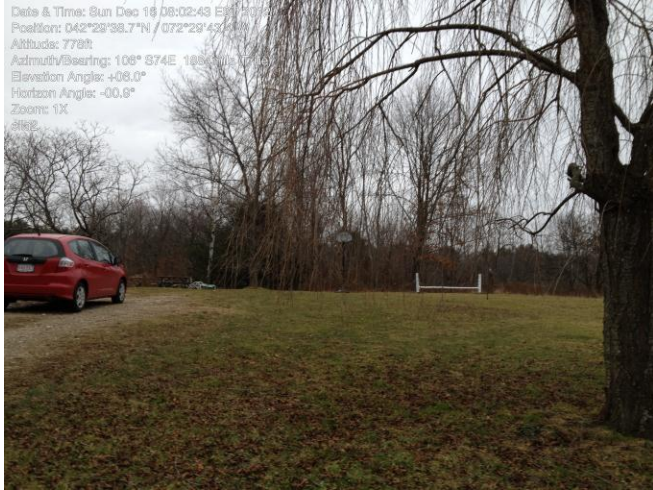
Basketball hoop and horse jump on RGT land?