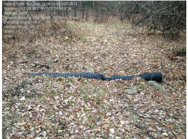
Culvert between two fields needs repair, or will soon.