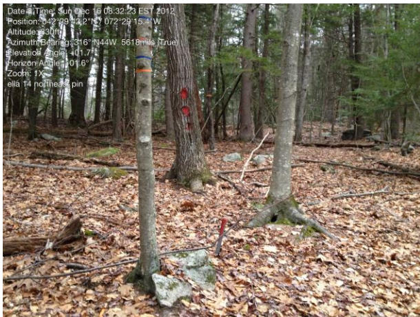
Northeast pin, well marked.