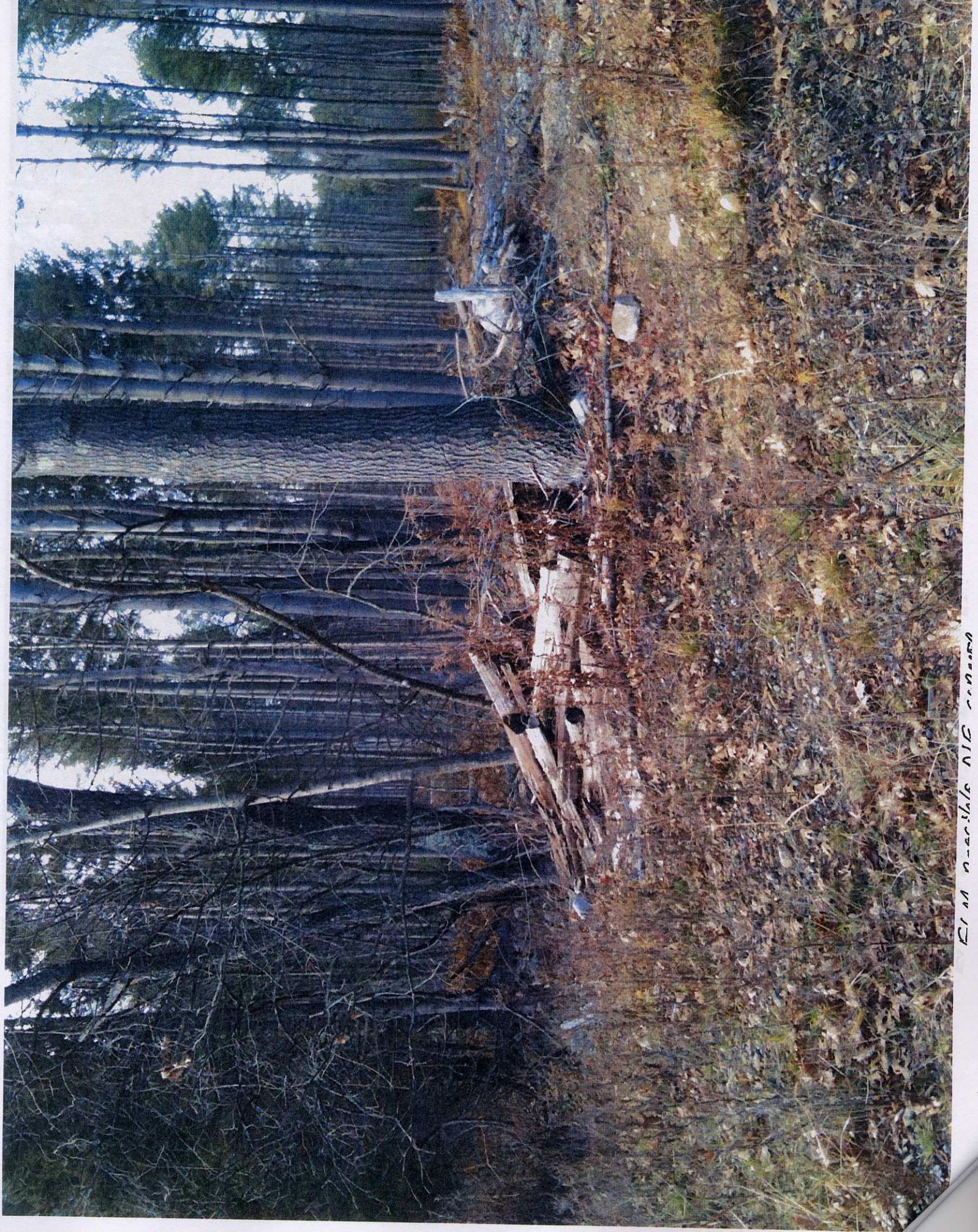
From near the N.E. corner