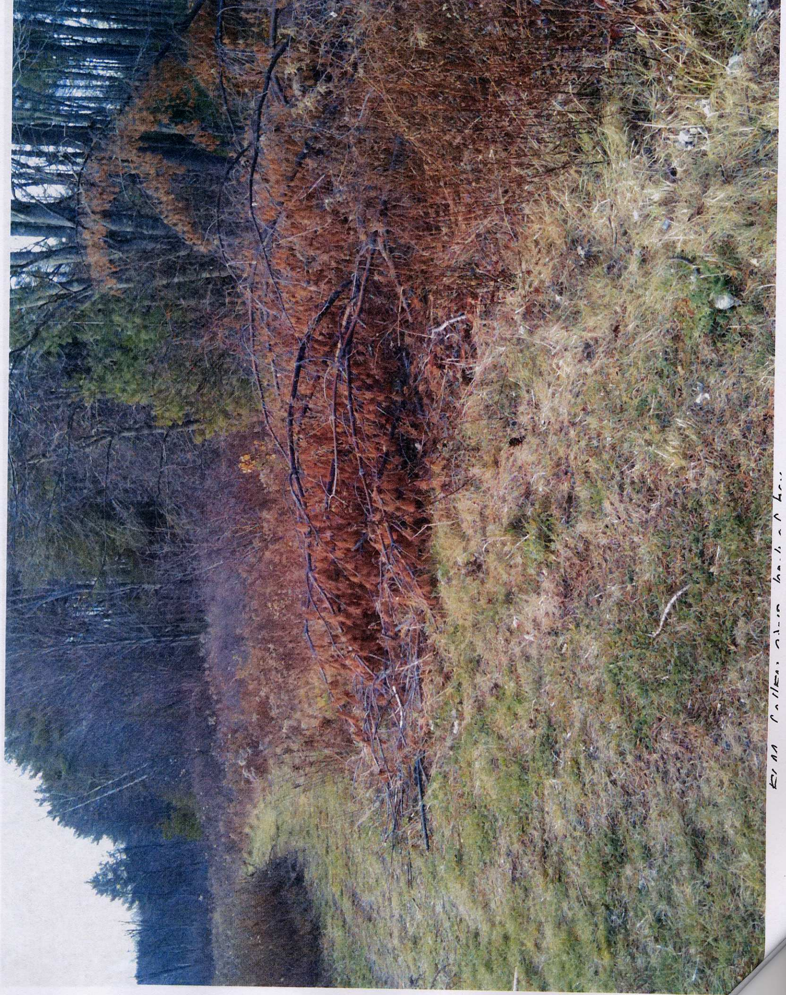
EVAN CALLEN'S SIDE BACK-UP