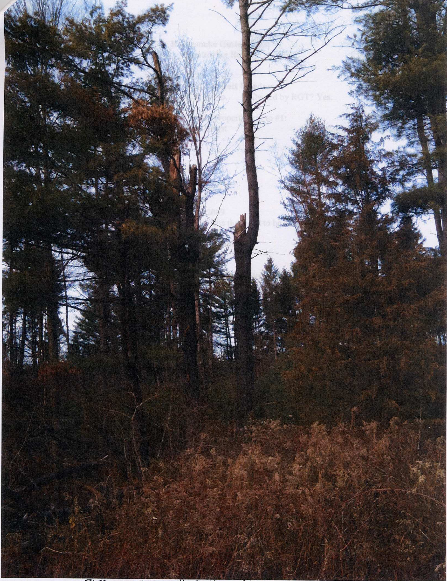
RIM SOURCE OF CANYON DRIVE