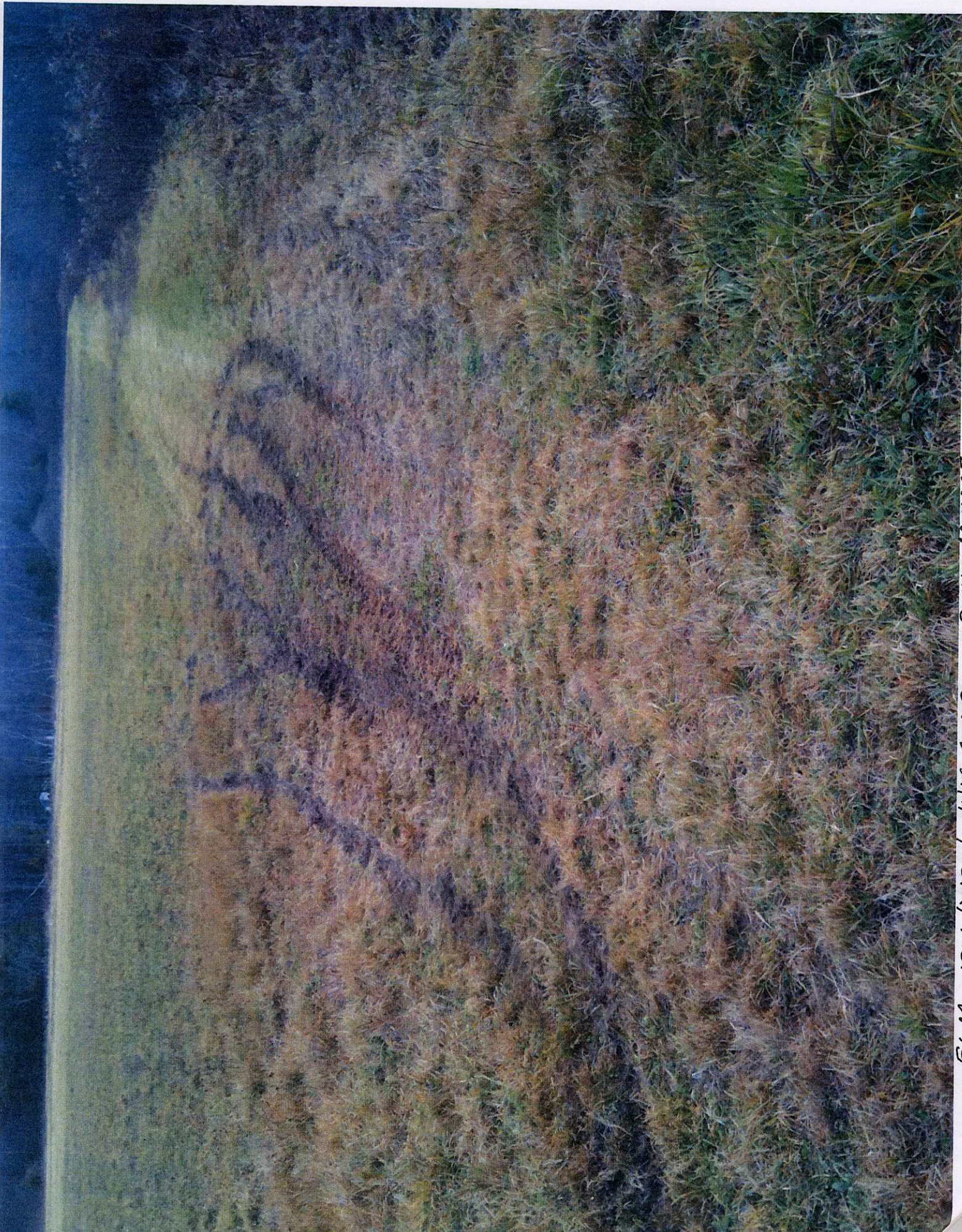
El M ... 100% + 100% ... 100% + 100% ... 100% + 100%