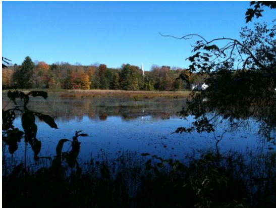
F5. Looking east, church and house on Depot Road visible. 10/8/2010 (taken from C & E Field corner)

While, there is no need to photograph this boundary, it is impossible not to pull out the camera during every visit. These pictures are taken more or less in sequence from the northern edge, around the corner to the eastern edge of the property's shoreline.