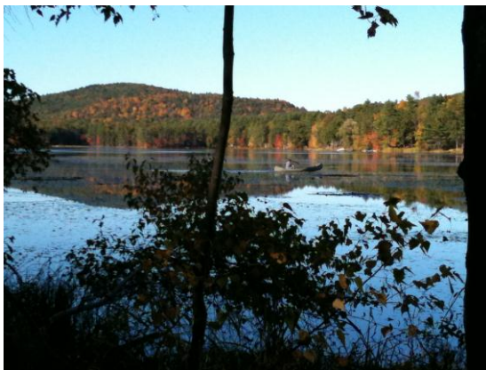
F7. Looking north to Joshua Hill Canoe visible. 10/13/2010