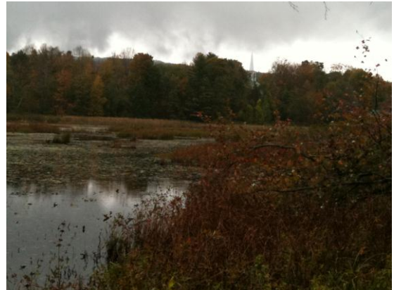
F6. Looking east to Congregational Church. Great Blue Heron present but not visible in photograph. 10/5/2010