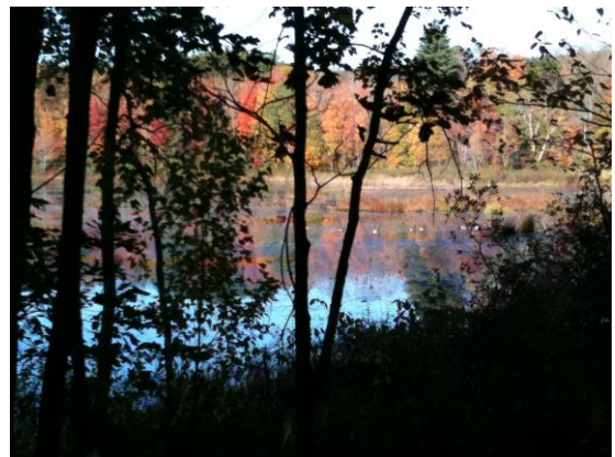
F8. Looking north, Canada Geese visible. 10/13/2010