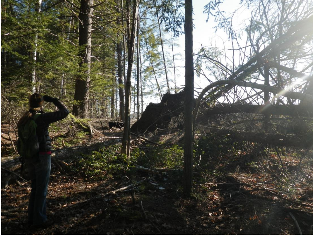
Uprooted tree from storm damage on the south edge of the property.