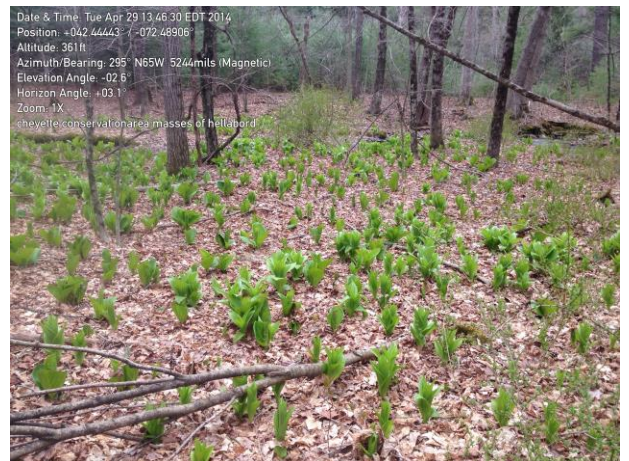
Hellbore near NW corner

All photos taken the April 29, 2014 with iphone app "Theodolite"