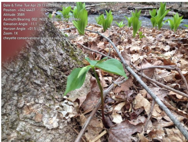
Wake Robin Trillium almost open