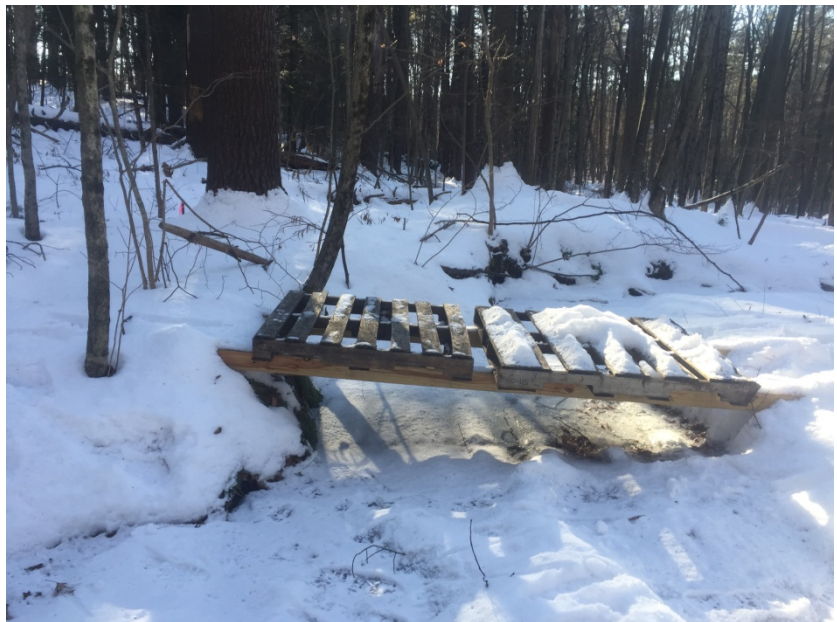
Photo of bridge on CHCA land to private home, not up to standards: